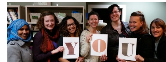
Pictured: Victoria Sexual Assault Centre Staff