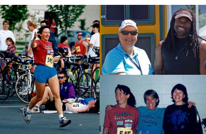
Triathlon photos over the years

1993 - The organization of the first annual triathlon for healing, VSAC's largest and longest running fundraiser. The triathlon eventually became known as the Triathlon of Compassion and has become a community event with racers and fundraisers of all ages. June 2022 marked the event's 29th anniversary.