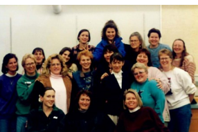
VSAC Team, 1990's

1991 - The formation of the sexual assault response team (or SART) occurred (and came into effect in January 1992). This is a 24- hour emergency service that provides immediate support and information to recent survivors of sexual assault at the hospital or police station. SART was developed as a coordinated response to sexual assault by Victoria Sexual Assault Centre, Forensic Nurse Examiners, Island Health, RCMP and the police.