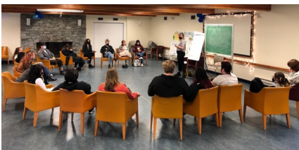
Project Respect Social Action Camp, 2022

1999 - The key VSAC prevention education program "Project Respect" was started. Project Respect brings together youth and adults to create awareness and dialogue about root causes of sexualized violence such as gender expectations and stereotypes, systems of power, and the ongoing colonization of the lands we live on. In 2004, "Project Respect" won the Women's Safety Award.