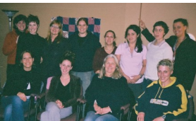
SART Team, 2003

1991 - The formation of the sexual assault response team (or SART) occurred (and came into effect in January 1992). This is a 24- hour emergency service that provides immediate support and information to recent survivors of sexual assault at the hospital or police station. SART was developed as a coordinated response to sexual assault by Victoria Sexual Assault Centre, Forensic Nurse Examiners, Island Health, RCMP and the police.